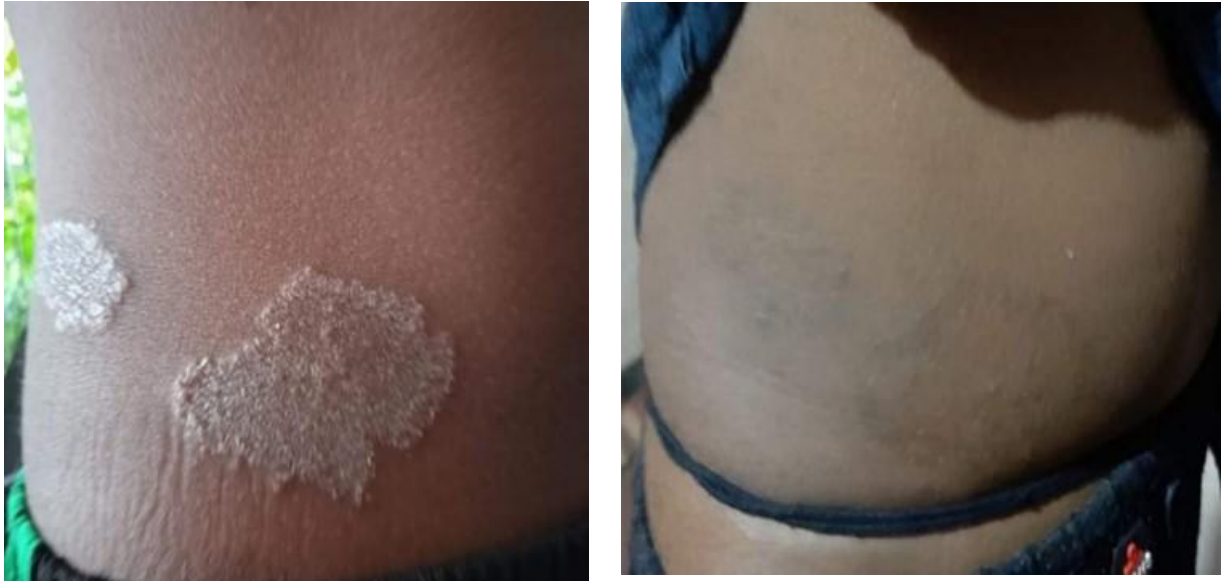
Figure: 2 Before and After Treatment