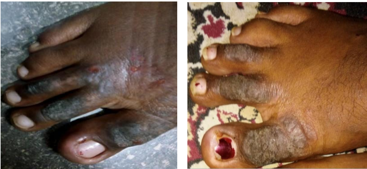
Figure: 2 Before and After Treatment

We choose LM Potency in this case because the selection of the similimum alone is not sufficient for a cure. The next step is choosing the exact potency and timely application of the dose. The potency and the dose also should be similar to the case. Here the individuality of the case decides the suitable remedy, potency and dose. (6) New dynamization method diminished this period to “one half, one quarter and even still less, not that much more rapid cure might be obtained” aph:246. Frequent repetition is permissible for even long lasting remedies it can be repeated if and when necessary. Aph: 246FN